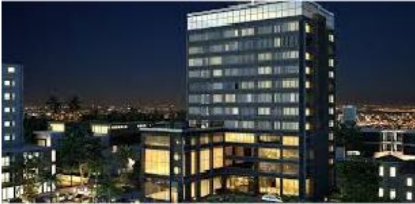
Shree Metalloys Limited Sun Square